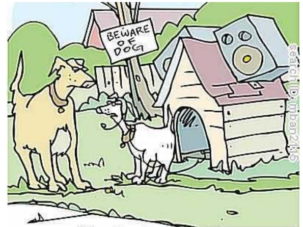
"The subwoofers really help."

When was the last time you got your ears checked? Hearing loss affect people of all ages and is not merely a sign of aging only 35% of people with hearing loss are older that the age of 64. The signs of hearing loss can be subtle and emerge slowly, or they can be significant and come on suddenly, either way, there are common indications you should suspect hearing loss.